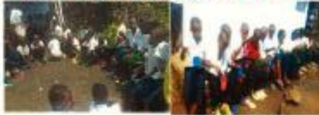
CHILDREN ENJOYING PORRIDGE