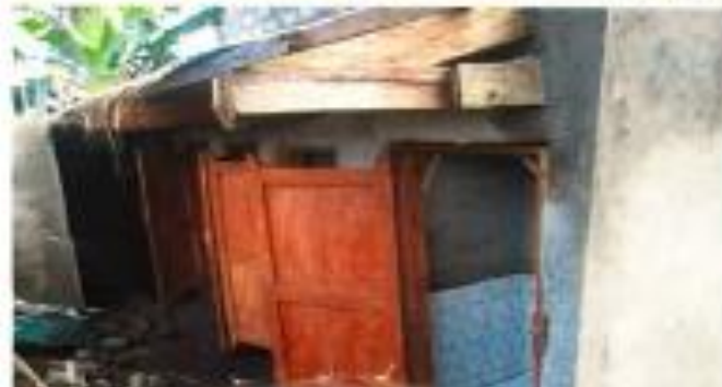
MODERN SCHOOL BUILDS FOR ORPHANS