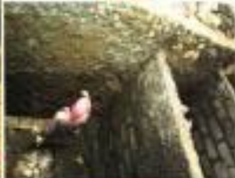
LOVING CHILDREN IN NEED