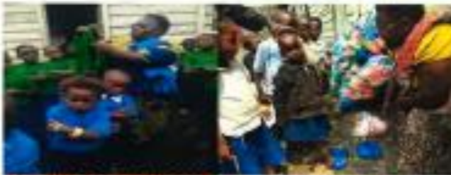
CLOTHING ORPHANS SHOESING