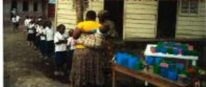
PORRIDGE - ONE CUP TO A CHILD IN NEED